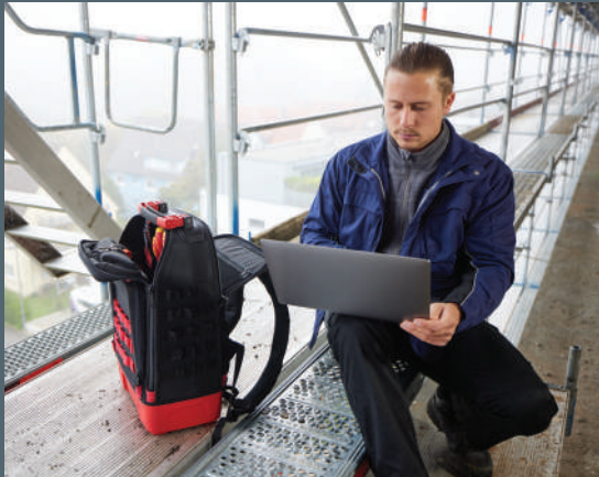
With the protected laptop compartment, you have your entire office along with you everywhere.