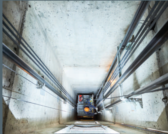
When working on difficult-to-access spots such as lift shafts.