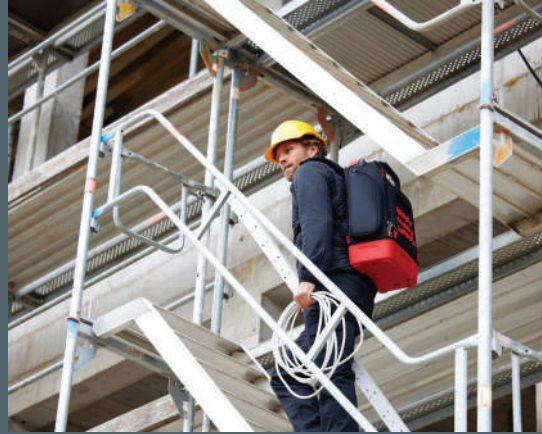
Leaves the hands free at all times, to transport additional material, for example.