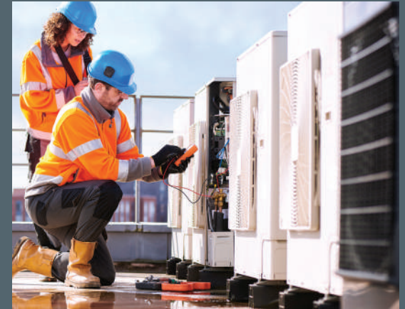
Installation and maintenance of air conditioning on the roof.