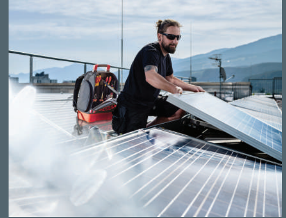
Convenient for working on roofs, such as solar heating system construction.