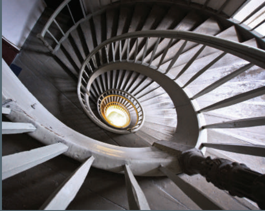
Ideally suited for jobs in buildings without lifts, e.g. in old buildings.